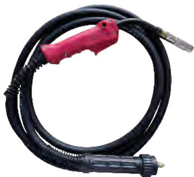
PANA 350A MIG TORCH (EURO FITTING)