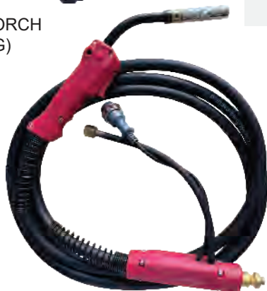
PANA 350A MIG TORCH (JAPAN FITTING)