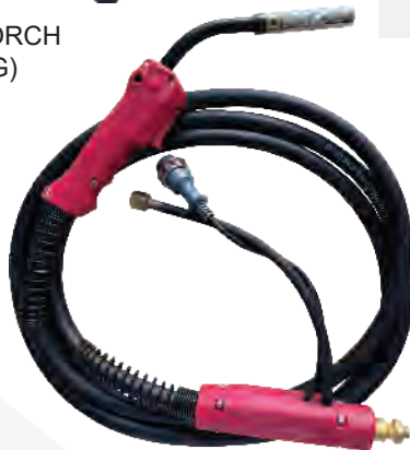
PANA 500A MIG TORCH (JAPAN FITTING)